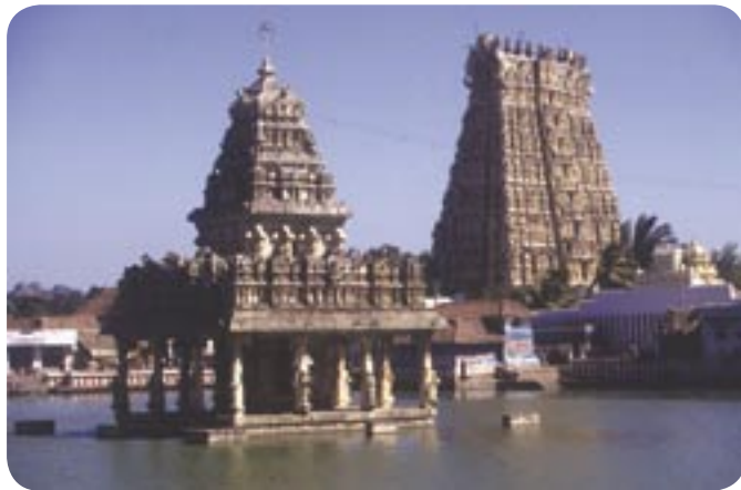
Suchinderam temple and tank for ritual bathing in Tamil Nadu

While most Hindus hold that pilgrimage is a great honour, some question its worth, arguing that true pilgrimage is the inner journey of the soul.