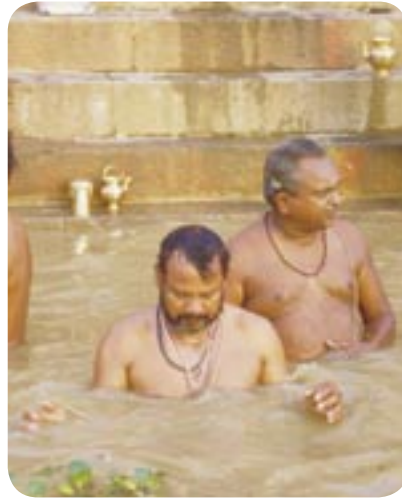
Pilgrims bathing in the River Ganges at Varanasi

Holy places for Hindus are usually located on the banks of rivers, coasts, seashores and mountains. Because water is essential for life, Hindus believe that it comes from God and is a part of God. This is one of the reasons why rivers are often places of pilgrimage in India, in particular the River Ganges at Varanasi (Benares). Bathing is also important in Hinduism because it is believed that the worshipper must be in a state of cleanliness to appear before God to worship.