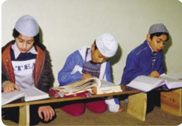
Young Muslims learning Arabic to read the Qur'an

The Qur'an was revealed to Muhammad in Arabic, and is still written in that language. This means that it cannot be changed or misinterpreted.